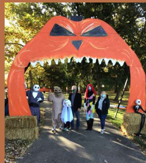
2020 Halloween Walk